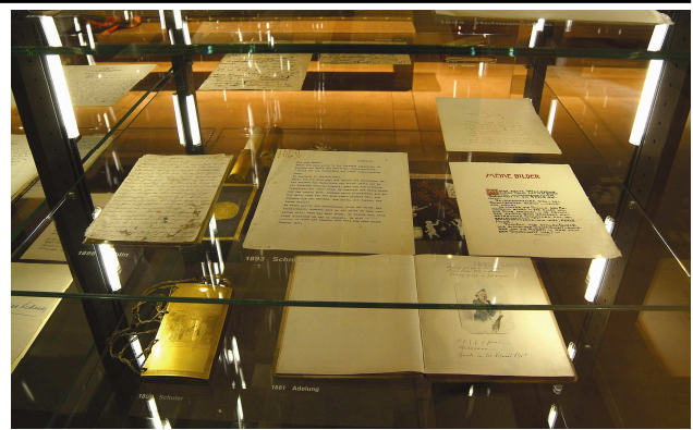
Exhibits in exhibition room 'Nexus'