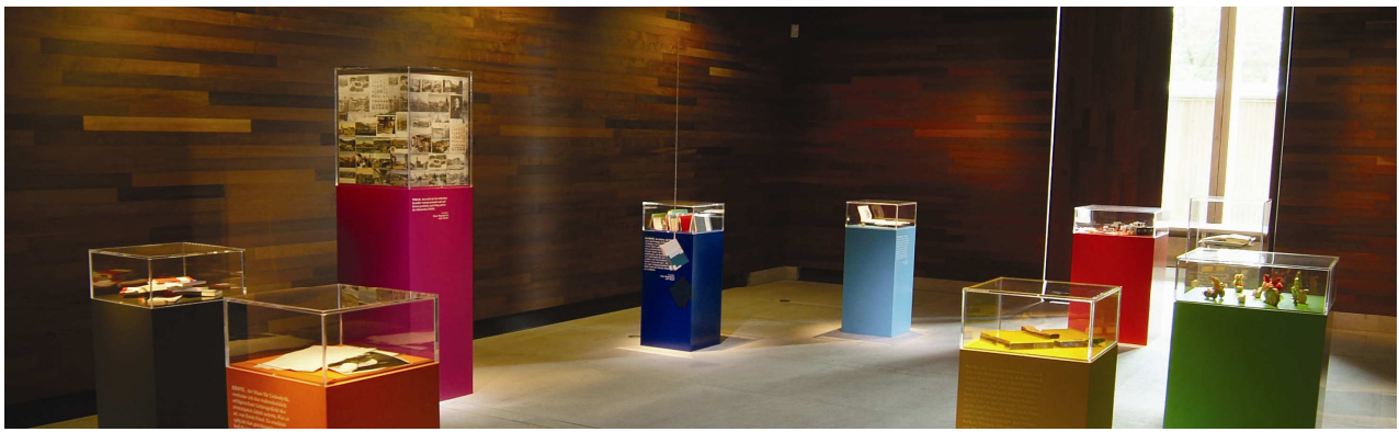
Exhibition room 'Fluxus'