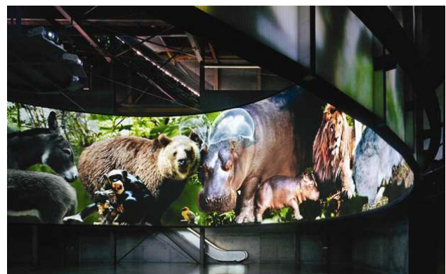
World of animals