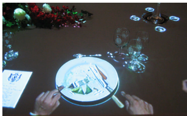
A real plate with projected food, cutlery and hands