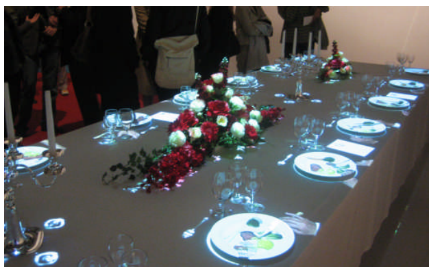
The decked table with projection in the exhibition