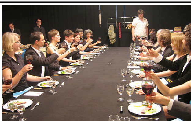
Definite film take in the iart studio