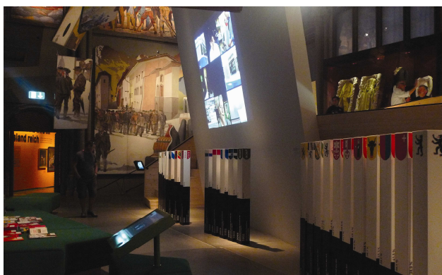
Projection in the exhibition 'Geschichte Schweiz' (History Switzerland)