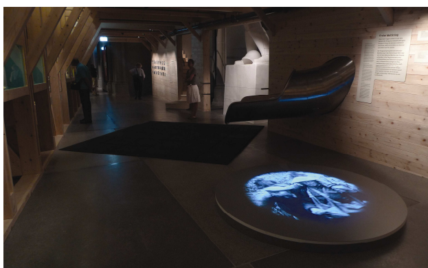
Round projection in the exhibition 'Geschichte Schweiz' (History Switzerland)