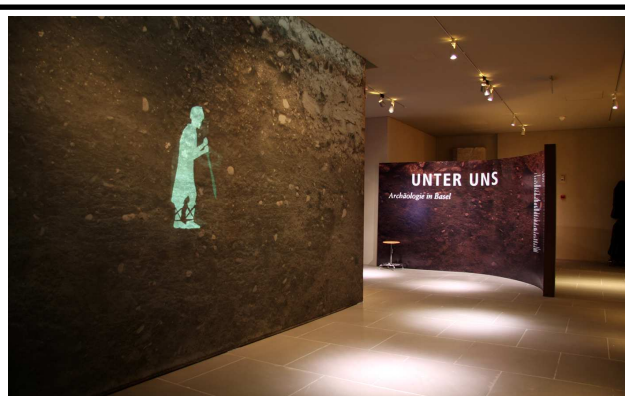
Animated figures at the walls