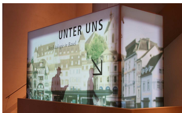
Pylon with film and moving silhouettes